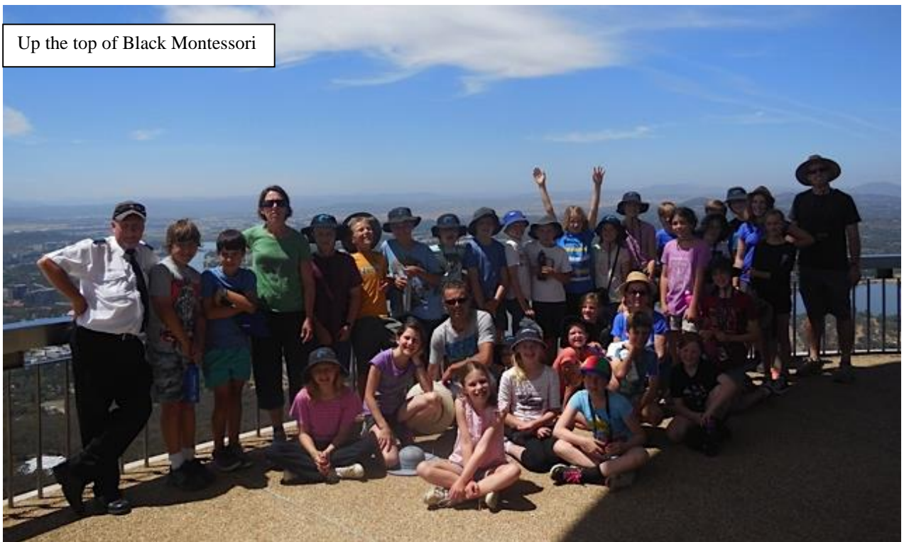
Up the top of Black Montessori