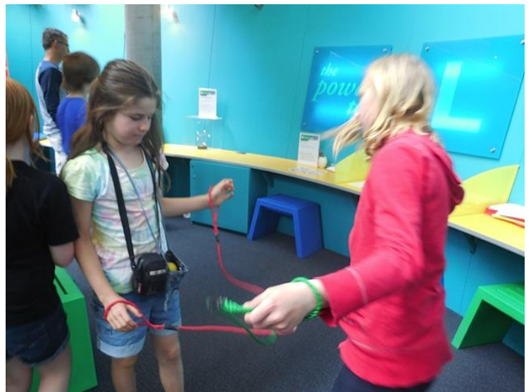
At CSIRO Discovery Centre