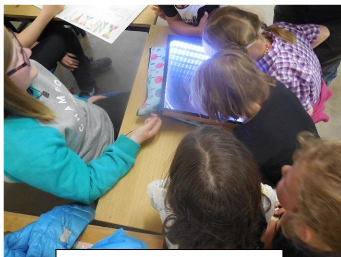
Pipa & Kestrel's infinity mirror