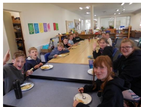
Every fortnight we have a shared 2-course lunch.