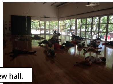
School drama fun in our beautiful new hall.