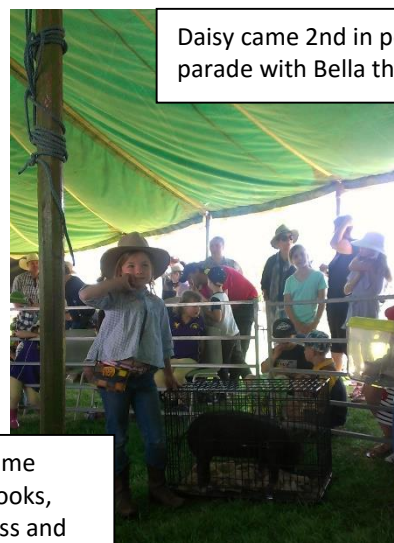
Daisy came 2nd in pet parade with Bella the pig

Thank you to the hard workers in our front gardens over the past few weeks. The area is looking so much better for all the work. Remember working bees are out the front of the every Friday morning after drop off.